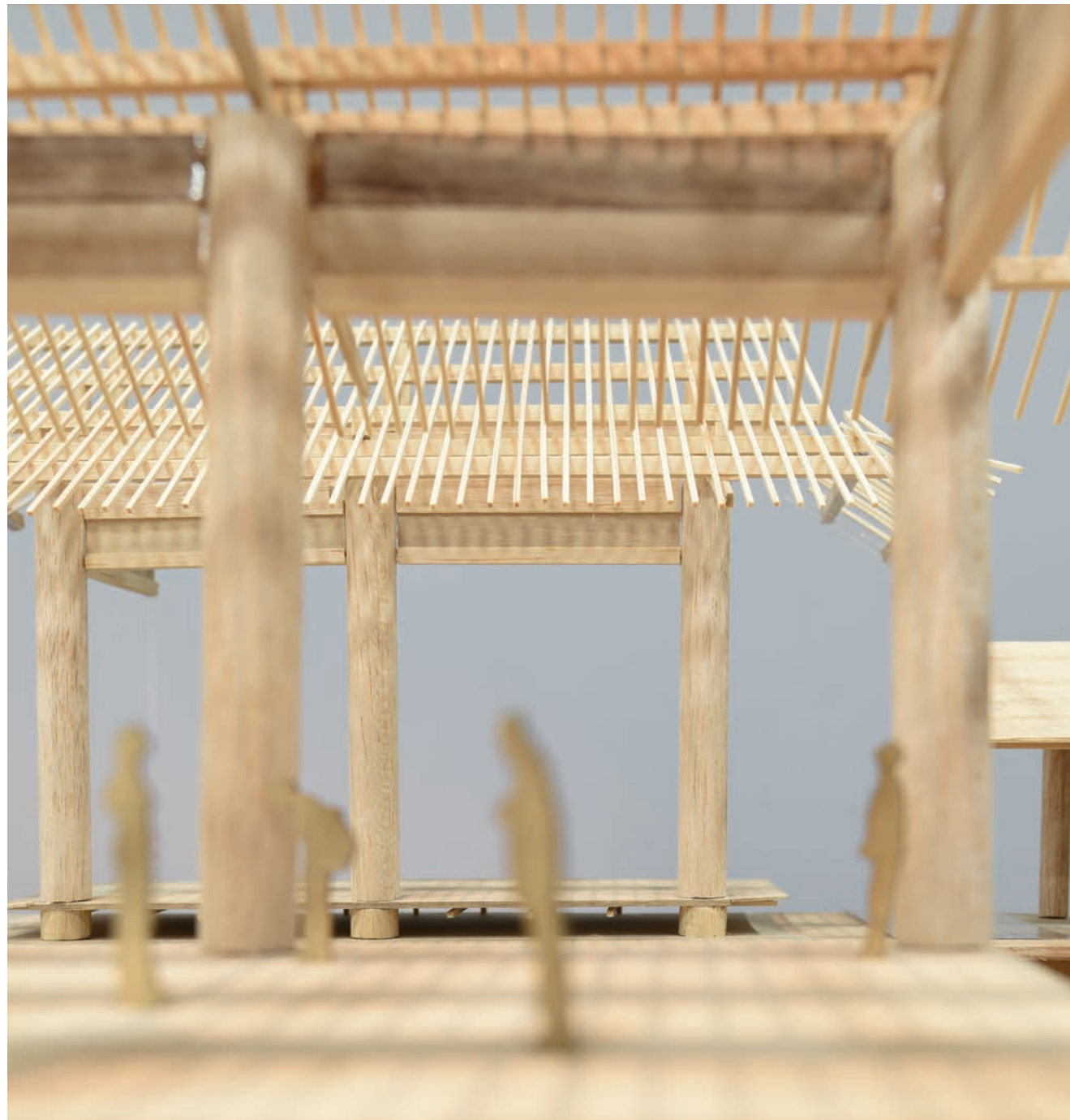
山手線へ乗り換えようと石造りの階段を登りホームに出れば伝統的木造屋根に覆われた神楽殿が現れる A traditional wooden roof structure will welcome people transiting towards the Yamanote line platform through stair space made of stone.