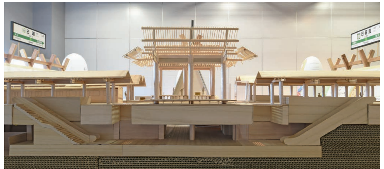
ホルーパーのトップライトから差し込む光が自然を知覚する契機となる Lights coming through the wooden louvre on the top light giving an opportunity for people to perceive nature.