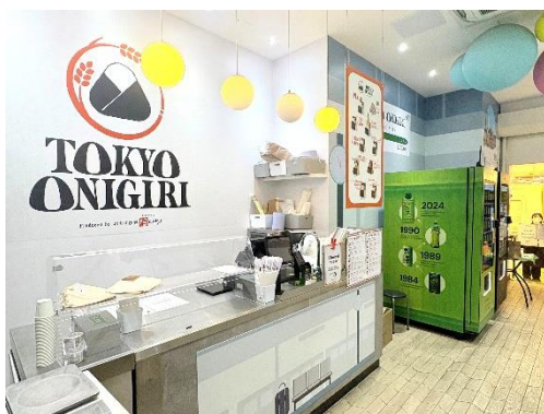
TOKYO ONIGIRI, produced by Honnoriya, opened in central London, offering freshly made onigiri

Through this initiative, we aim to further enhance public transport-centred lifestyles in cities around the world and enable the Lifestyle Transformation (LX) set out in the JR East Group’s Management Vision, “To the Next Step 2034.”