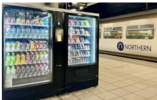
Vending machines operated by Decorum at railway stations

Following the acquisition, the number of vending machines under operation will increase to 1,800, extending our smart retail presence from railway stations to airports.