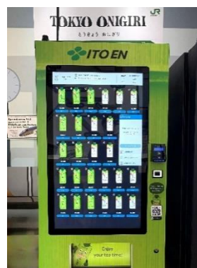
“Oi Ocha” vending machine installed in collaboration with ITO EN