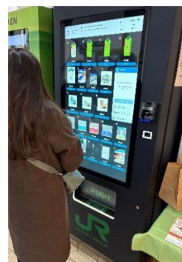
Vending machine offering rail-themed merchandise and crafts from Tsubame-Sanjo