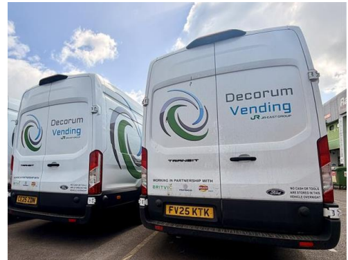
Decorum’s vans with the JR East Group logo