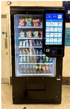
Vending machine with a touchscreen

Additionally, we are committed to offering vending machines featuring Japan’s local specialties and providing unique consumer experiences, while also contributing to the promotion of regional attractions.