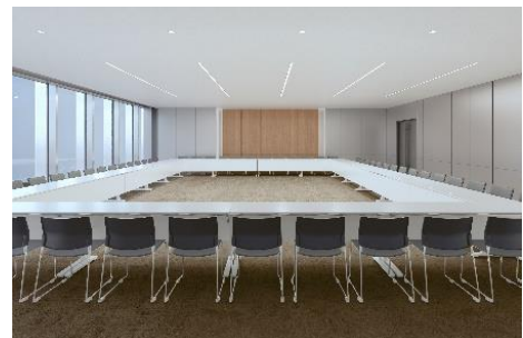
Conference Floor Room (image)

There are a variety of spaces, such as 3 medium spaces that can be divided into twos, and other small spaces which can also be used as anterooms. These rooms can be used for business events, seminars and other possible events.