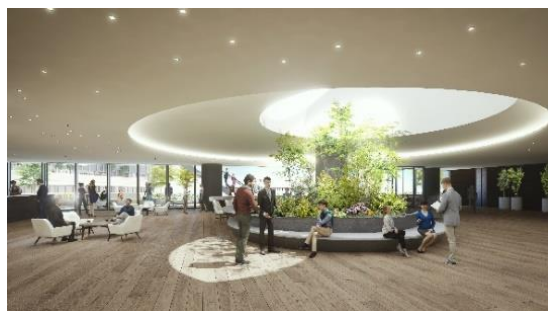
Conference lobby (image)

There will be areas where attendees can refresh during breaks, such as the garden terrace overlooking the station square. If you wish to concentrate on your work, there are working spaces in the conference lobby.