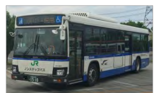
JR Bus Kanto - Route bus