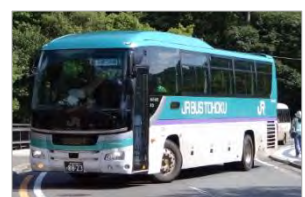
JR Bus Tohoku's "Mizuumi" (Aomori Station - Lake Towada)