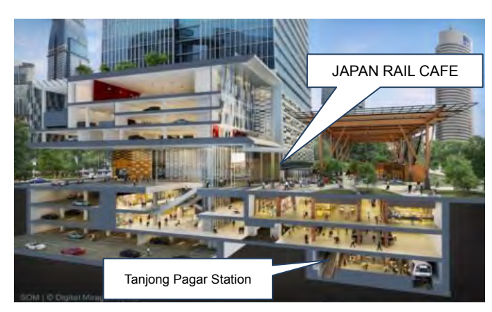
Access to JAPAN RAIL CAFE