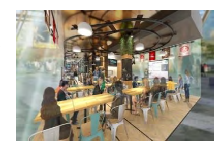
In-store event image

Seasonal cuisine and drink, as well as sundries and foods, that give a sense of Japan will be sold.