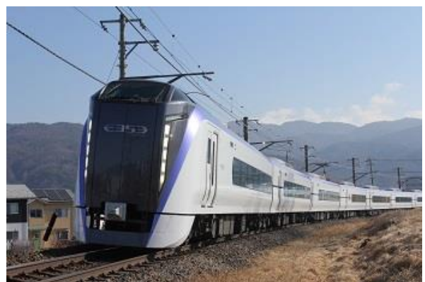
New model vehicle (E353 series)

* Further notification will be sent of details such as starting date of service.