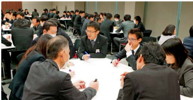
A general meeting of Work-Life Network members

To advance the diversity of our workplaces, we conduct training for managers and hold forums and seminars. Furthermore, in each workplace we implement Work-Life Network activities, and network members organize seminars and other activities. Also, centered on the Head Office, we hold Family Day events in which members of employees' families visit workplaces.