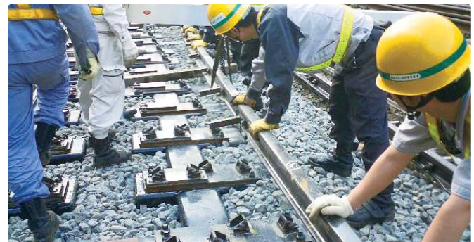
Skills training centers

Integral to our efforts to ensure that experienced employees pass on their technologies and skills to the next generation of technical staff, who will carry the responsibilities for railways in the future, is our establishment of skills training centers designed to support the continuity of railway-specific technologies and skills in individual workplaces. We have established 104 centers by also making use of existing training facilities.