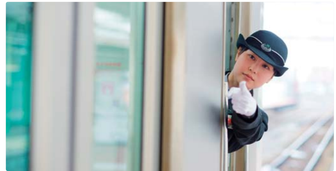
Promoting the roles of female employees

The number of workplaces, both field and office, in which female employees can work is growing every year. For example, about 40% of train crew members on the Yamanote Line are female employees. The number of female managers is also increasing every year, with female employees taking important positions such as Head Office and Branch Office managers, chiefs of field offices (stationmasters), and Board members of Group companies.