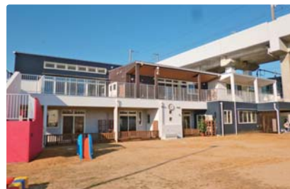
Nursery school near station