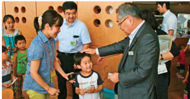
Employees' families visiting a workplace on Family Day