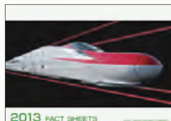
› 2013 Fact Sheets

JR East's Fact Sheets provide a clear explanation of various aspects of the Company, including the outline and strategy of the railway business and the development of the life-style business, as well as the important topics such as safety, globalization and environmental activities using quantitative data and graphs.