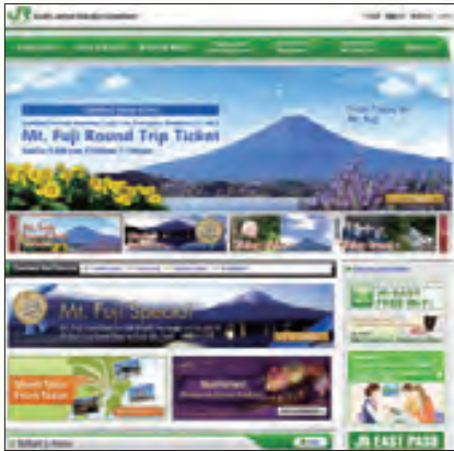
› Home Page http://www.jreast.co.jp/e/index.html

JR East's website offers a variety of information including investor relations (IR) information, company data, and an overview of the Company's businesses. The website can be viewed in Japanese, English, Chinese and Korean. The Annual Report and various other reports can also be downloaded from the website. The website also contains a wealth of tourism information about Japan and related information.