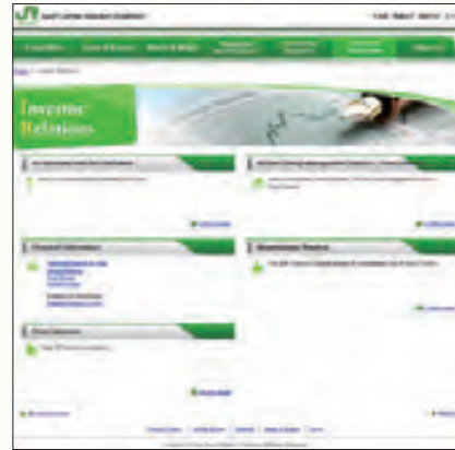
› Investor Relations http://www.jreast.co.jp/e/investor/index.html