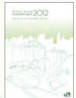
› Sustainability Report 2012

The Sustainability Report is published annually in Japanese and English. The report states JR East's basic policies on CSR, and includes examples of the Company's CSR activities.