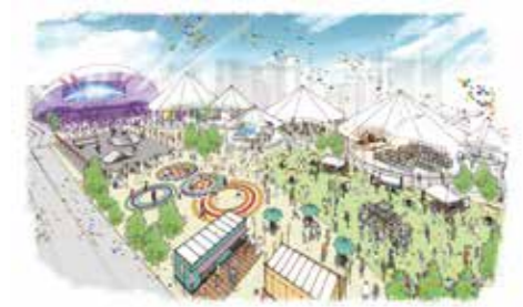
Image of event space outside station

Furthermore, for the enjoyment of people visiting from both Japan and abroad, we are planning to create an exhibition space that will give visitors a taste of the future station and surrounding development, offer experiences in line with themes such as food, music and art, open shops offering Japanese food, products and experiences, and hold sports events.