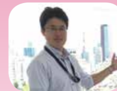
Shinagawa and Large-Scale Development Department East Japan Railway Company

My role is to put on an event using the vast space in front of the station in conjunction with the opening of Takanawa Gateway Station. We will coordinate and consider the details for putting on the event, its content, and so forth with our partners and relevant departments. While this is a limited-time event lasting around six months after the opening of Takanawa Gateway Station, we will strive to make it a memorable occasion that will attract many visitors and build anticipation for the future community's development.