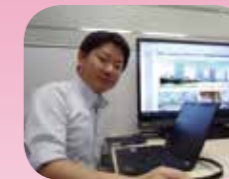
Shinagawa and Large-Scale Development Department Corporate Planning Headquarters East Japan Railway Company

I am involved in planning the introduction of facilities for harnessing unused energy, such as biogas utilization facilities and fuel cells, holding discussions with the authorities and ensuring compliance with laws and regulations relating to the installation and operation of such equipment, and developing efficient operation schemes. Going forward, along with ensuring a stable supply of energy, we will continue developing plans for harnessing unused energy by implementing more cutting-edge systems with a higher level of environmental performance, in order to make the Shinagawa area a model for pioneering environmental urban development.