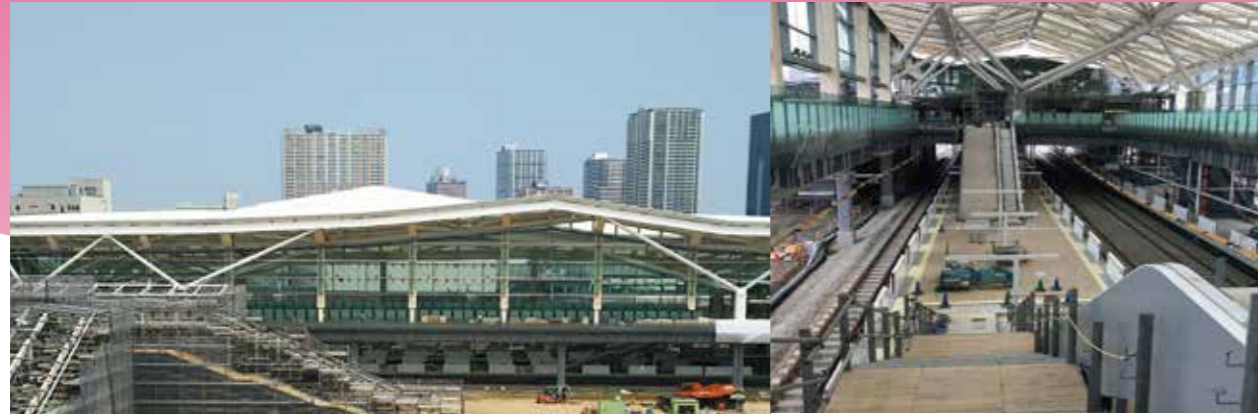
Takanawa Gateway Station