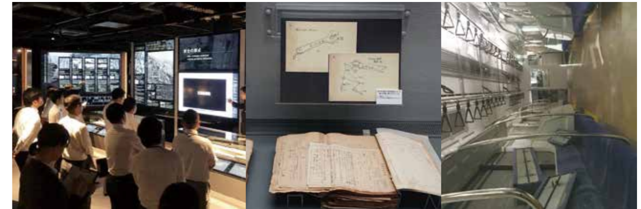
Education utilizing digital signage