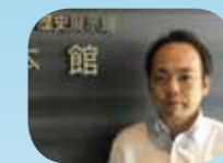
General Education Center JR-East Personnel Service Co., Ltd.

I was involved in safety training as an instructor at the JR East General Education Center. Many employees from the JR East Group have visited the Accident History Exhibition Hall for the purpose of learning, and whenever they do, they meet with an instructor. Once employees feel the terror and tragedy of train accidents and the importance of saving lives, think about the meaning of safety, and resolve not to let such accidents happen again, thanks to what they have learned at the Accident History Exhibition Hall, they become more conscious of the root causes of accidents and take action to prevent accidents when they return to their workplace. Railway operations and risk go hand in hand. Safety requires that every single person involved in railway operations takes their work seriously and strives to create a safe environment without cutting corners. As instructors, we think seriously about accidents at the Accident History Exhibition Hall and pursue Ultimate safety levels by clearly communicating how important it is that visitors and the people they work with do not cause accidents or allow them to happen.