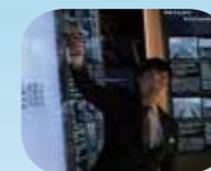
Oyama Track Maintenance Technology Center, Omiya Branch Office East Japan Railway Company

I was the project supervisor for the large-scale expansion of the Accident History Exhibition Hall in October 2018. During the long history of railways, numerous tragic accidents have occurred. Each time, our predecessors thought long and hard about how to prevent the same thing from happening again. I gained a deeper understanding of how this led to the safety rules and equipment that we have today through working on the expansion project. In the future, through collaboration with instructors at the JR East General Education Center, we will work to provide comprehensive safety training using the Accident History Exhibition Hall, so that each employee will be able to carry out their work with a better understanding of how the rules and equipment with which we are familiar were developed and the thinking behind them.