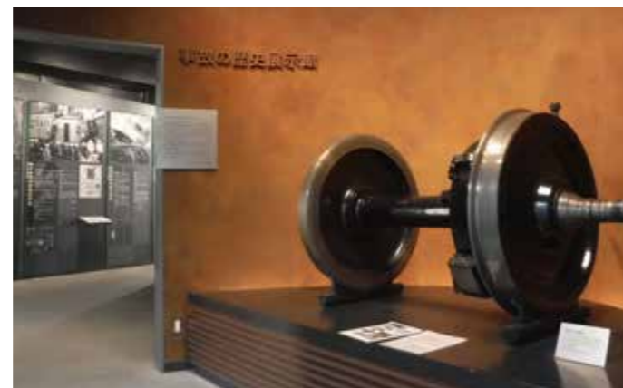
Exhibition of actual thing at the entrance of "Accident History Exhibition Hall." Established since opening.

Based on our policy of understanding and learning from accidents and taking safety to heart, we are encouraging all JR East Group employees to implement safe behavior through a combination of theoretical training and practical learning about the history of our safety systems, the process by which our operating rules were decided, our attitude toward accident prevention, the importance of protecting the lives of passengers and other people, etc.