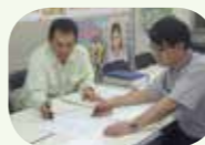
(Shinanomachi) Chief facilities Engineer

Shinjuku Building Technology Center, Tokyo Branch Office