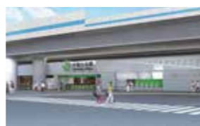
A façade design was adopted as it gave attention to visibility from around the station

As Sendagaya Station is the nearest station to the New National Stadium and the Tokyo Metropolitan Gymnasium, station upgrades are underway targeting use before the Tokyo 2020 Olympic and Paralympic Games begin.