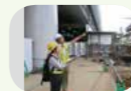
(Sendagaya) Facilities Engineering Staff member

We are in charge of the station upgrades at Sendagaya and Shinanomachi Stations, which are the gateways to the New National Stadium, the main venue of the Tokyo 2020 Olympic and Paralympic Games. As construction is underway, we are daily cooperating with related parties so that we can provide safe and comfortable facilities to domestic and international customers who will use the stations during the Olympics. As we go to work daily, we try to keep, "facility maintenance from the customer's perspective" in the forefront of our minds. We have made special consideration and have planned our methods so that we do not cause inconvenience and to enable safe use during the construction period, while allowing for safe, convenient, and secure use for various customers even after the station upgrades are completed. As railway construction engineers, our hope is to continue to impress our clients and create stations that are loved for many years to come.