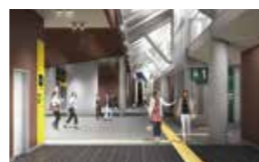
Making a bright, comfortable space by constructing an atrium that connects the platform to the concourse