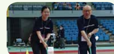
Chiba Station Staff, Chiba Office Branch

We are in charge of the station upgrades at Sendagaya and Shinanomachi Stations, which are the gateways to the New National Stadium, the main venue of the Tokyo 2020 Olympic and Paralympic Games. As construction is underway, we are daily cooperating with related parties so that we can provide safe and comfortable facilities to domestic and international customers who will use the stations during the Olympics. As we go to work daily, we try to keep, "facility maintenance from the customer's perspective" in the forefront of our minds. We have made special consideration and have planned our methods so that we do not cause inconvenience and to enable safe use during the construction period, while allowing for safe, convenient, and secure use for various customers even after the station upgrades are completed. As railway construction engineers, our hope is to continue to impress our clients and create stations that are loved for many years to come.