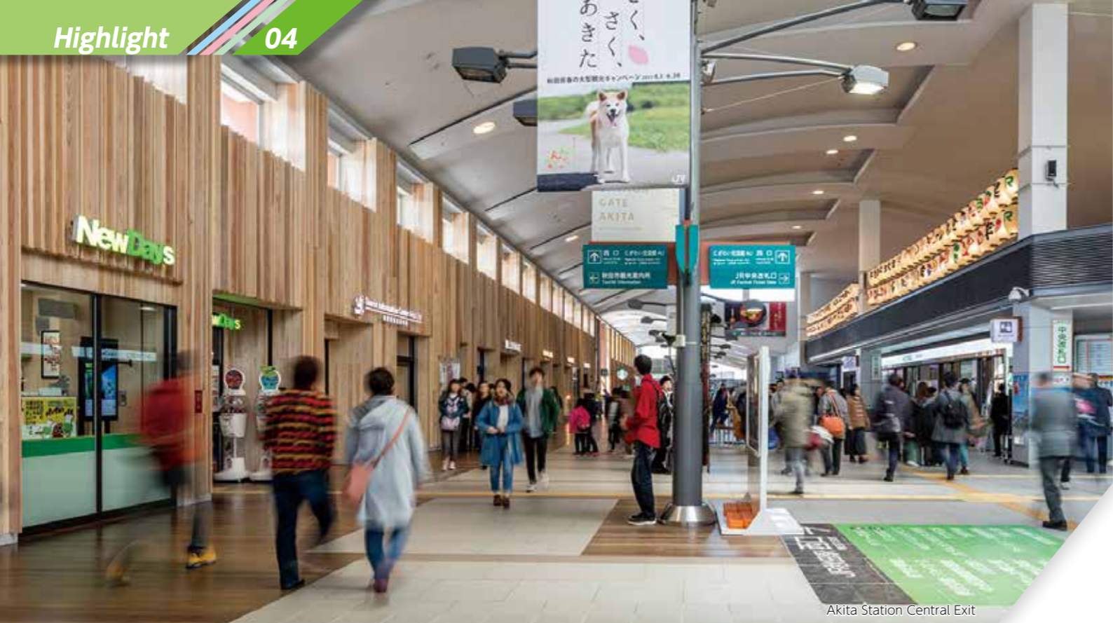
Akita Station Central Exit