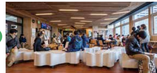
The waiting lounge where all five senses can experience the feeling of Akita