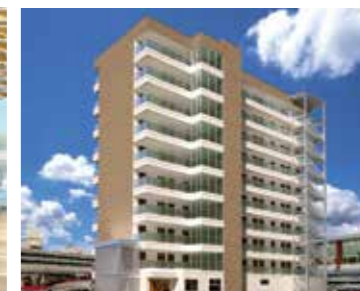
A student condominium and training camp facility in front of the station will make it possible for younger generations to be active