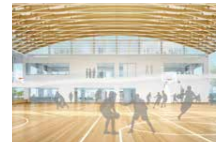
The arena will be constructed in such a way that passers-by will be able to see into the interior, thereby creating a venue open to the whole community

Akita Station east exit is proceeding with the platinum town concept where three generations can live comfortably through health and sports. We will develop a sports arena, child care facilities, a clinic, and a student condominium and training camp facility with the aim of revitalizing the town in collaboration with nearby parks and sports facilities.