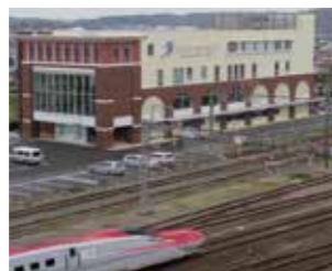
Joto Sports Orthopedic Clinic

In April 2017, to commemorate the 20th anniversary of the opening of the Akita Shinkansen Komachi, the renovated Akita Station and west exit