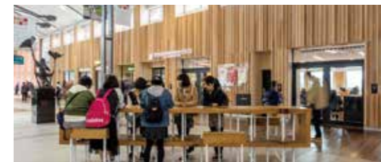
Exterior wall and furniture made of Akita cedar create a sense of coziness