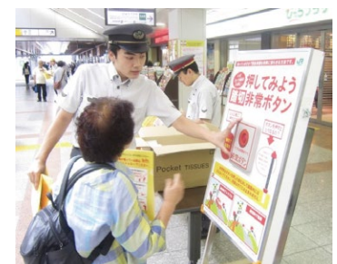
Level crossing simulator