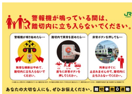
During the campaigns, we post campaign posters and distribute pocketable tissue packs with campaign information at stations.

We ask our customers and neighboring communities for cooperation in the safe use of level crossings, through awareness increase activities with local police stations and by posting campaign posters at stations.