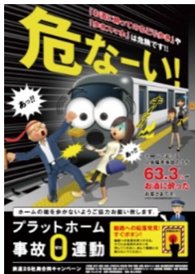
Platform zero accident campaign

We are conducting platform zero accident campaigns to alert customers to avoid coming into contact with trains or falling onto tracks at platforms. Additionally, the campaigns aim to ask customers to push emergency stop buttons when they sense danger.