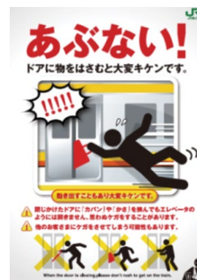
Campaigns to prevent customers and their belongings from being stuck between doors

The campaigns aim to alert customers of the dangers involved in jumping onto trains or getting their belongings trapped between closing doors.