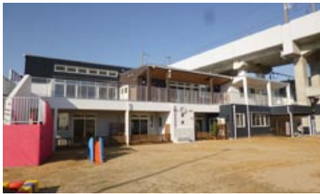
Nursery school near station along the Shinkansen line (Taishido Suisen Nursery School)

JR East has opened childcare support facilities such as “nursery schools near stations” located in easily accessible areas that are usually within a five-minute walk from the station, to support the combination of childcare and commuting to work. A total of 82 childcare support facilities were opened from 1996 through April 2015, and JR East is continuing to increase the number of these facilities. These nursery schools near stations have the advantage that parents can drop and pick up their children on the way to and from work. As evidenced by the scene that children come to the nursery with fathers, our childcare support encourages fathers’ participation in childcare as well.