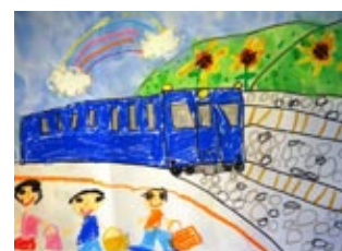
Sixth Children’s Train Craftwork Exhibition