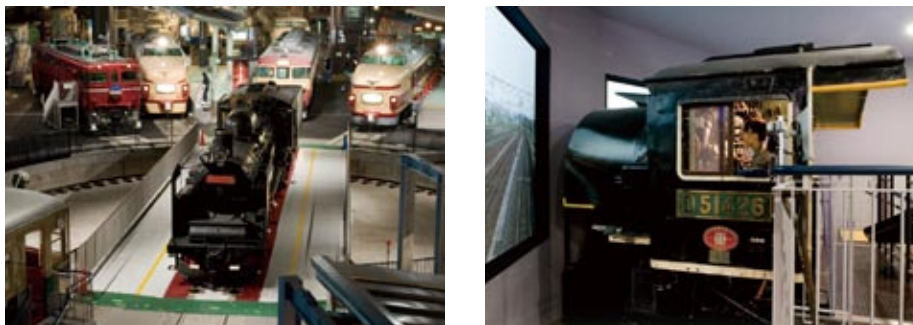
The Railway Museum

On October 14, 2007, the Railway Day, the Railway Museum was opened in Saitama City, and it is based on three major concepts. It was designed to be a museum that systematically conducts surveys and research using railway-related heritage and reference materials, a history museum that depicts the history of railways focusing on exhibits of locomotives and cars, and an educational museum where visitors can learn about railway principles, systems and technologies through hands-on experience. Since its opening, The Railway Museum has proved to be a great success, attracting about 800,000 visitors in the fiscal year ended March 2014. Going forward, renewal work of building interior and construction of a new building are scheduled in time for its 10th anniversary in October 2017.