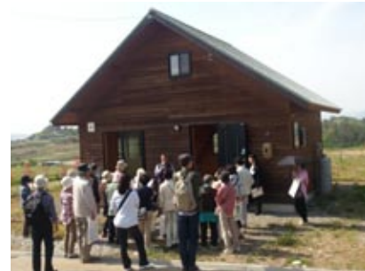
Migration trial tour

People moving to regional cities or making short stays there sometimes need support, especially in the aspect of mobility. We offer support using Group resources, such as long-term car rental discount plans for members of the Otona no Kyujitsu Club.