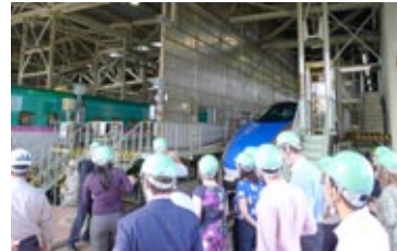
Inspection by the embassy staff (Shinkansen General Rolling Stock Center)