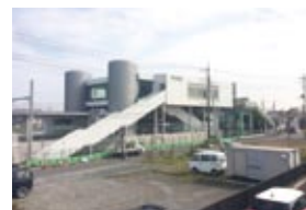
Free passage at Kobayashi Station on the Narita Line