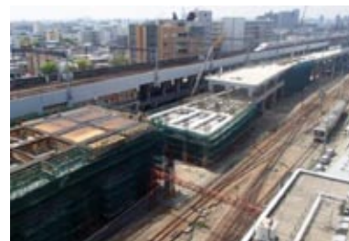
Railway overpass construction project near Niigata Station on the Shin-etsu Line