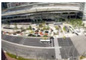
Square in front of the Yaesu Exit, Tokyo Station

We are also cooperating with local governments in the creation of new stations, in line with their city planning, and the improvement of existing station buildings with free passages and other facilities, based on requests from local authorities. In the fiscal year ended March 2015 we opened a new station, Tendominami, on the Ou Main Line, and we improved Iiyama Station on the Hokuriku Shinkansen and the Iiyama Line by building a tourist information desk, etc. (local government facility). As a result, since our establishment in 1987 we have introduced local government facilities into a total of 86 stations (as of March 31, 2015). Kataoka Station on the Tohoku Main Line, Sodegaura Station on the Uchibo Line, Kobayashi Station on the Narita Line and Uchino Station on the Echigo Line were also improved by construction of free passages in the fiscal year ended March 2015.