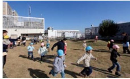
Children playing on station rooftop playground (J-Kids LUMINE Kitasenju Nursery School)