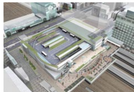
Upgrading of Transfer Node in Shinjuku

Large numbers of people pass through stations where different transport services meet. To reduce urban area congestion and to make travel more convenient, we have been increasing the number of through services and improving our connections with other means of transport, in cooperation with national and local governments. We are also improving transfer nodes to other transport, such as to bus terminals and taxi loading areas. One example is constructing a bus terminal above the railway tracks at Shinjuku Station, in collaboration with the Ministry of Land, Infrastructure, Transport and Tourism, which contributes to the convenience of the entire multi-mode transportation system.