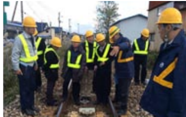
Training for overseas railway operators (Akita branch office)

JR East also receives inspection visits by overseas visitors involved in railway operations. During the fiscal year ended March 2015, for example, we had approximately 1,300 visitors from 49 countries. The visitors have included government officials from each country, people engaged in railway operation and researchers from universities and research institutes. These visits help to promote mutual understanding.