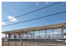
Tendominami Station on the Ou Main Line