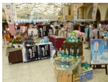
Rediscover Local Areas Project "Farm fresh market"

We are working to revitalize the local food industry by holding farm fresh markets and through encouraging the expansion of agriculture, forestry and fisheries to include food processing, logistics and marketing.