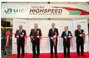
The 9th UIC World Congress on High Speed Rail (Tokyo, July 2015)

In order to showcase features of Japanese railway systems to overseas railway-related parties, we have been actively participating in overseas trade shows, seminars and so on as well as inviting international conferences. In September 2014, we participated in InnoTrans, one of the largest international railway shows. In July 2015, we held the “UIC World Congress on High Speed Rail,” the world’s largest international conference and exhibition focusing on high-speed railways, in Tokyo in collaboration with UIC and attracted over 1,200 individuals from railway-related parties.