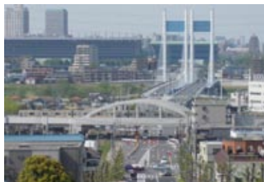
Railway overpass construction project near Inagi-Naganuma Station on the Nambu Line

In the project to construct a series of railway overpasses near Inagi-Naganuma Station on the Nambu Line, all 15 level crossings in the section subject to the project were removed by placing the railway on a viaduct in December 2013; and in the project to construct a railway overpass near Niigata Station on the Shin-etsu Line, we finished switching to temporary lines in November 2014 and are currently constructing the main structure. As these projects help eliminate traffic congestion and unify towns, we are contributing to city planning and smoother traffic by cooperating in such projects.