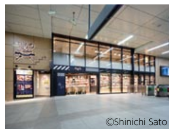
NOMONO, the local produce shop