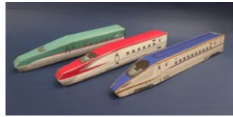
Image of completed paper-craft work

Various events that parents and children can enjoy together, such as a Paper-craft Class showing how to make a 3-D Shinkansen mock-up from special paper, take place in a variety of locations.