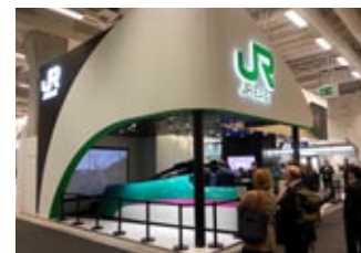
Participation in InnoTrans (Berlin, Germany, September 2014)