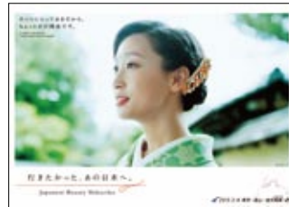
“Japanese Beauty Hokuriku: The Japan I Wanted to Visit” poster