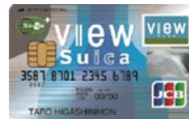
View Suica Card