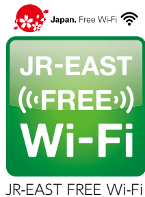
JR-EAST FREE Wi-Fi

As overseas visitors feel that the free public wireless LAN environment in Japan is inconvenient, we provide and have installed free public wireless LAN services at 41 stations (mainly on the Yamanote Line) and at the "JR EAST Travel Service Centers" which are used by many overseas visitors. (This service is provided in four languages: English, Chinese, Korean and Japanese.)