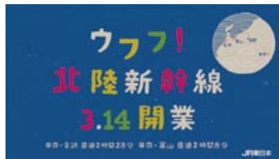
“Smile! The Opening of the Hokuriku Shinkansen” footage from TV commercial

In preparation for the opening of the Hokuriku Shinkansen Line to Kanazawa, we conducted a “Japanese Beauty Hokuriku Campaign” as one of the original measures beforehand in October 2014 and highlighted the attractions of the Hokuriku region to foster the mood for its opening. In addition, as our focus on the Hokuriku Sales Center set up in April 2013, we joined forces with local governments and JR West to prepare development of tourism routes covering a wide area, including the Hokuriku region (Fukui, Ishikawa and Toyama Prefectures) and the Shin’etsu region (Niigata and Nagano Prefectures). We will also conduct a “Hokuriku Destination Campaign” in October 2015 and continue to work closely together with JR West and local communities in preparation.