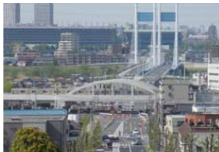
Railway overpass construction project near Inagi-Naganuma Station on the Nambu Line

In the project to construct a series of railway overpasses near Inagi-Naganuma Station on the Nambu Line, all 15 level crossings in the section subject to the project were removed by placing the railway on a viaduct in December 2013, thereby eliminating traffic congestion, unifying towns and contributing to city planning and smoother traffic.