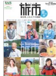
Travel products "Tabi-Ichi"