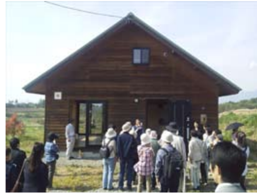
Migration trial tour