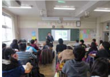
Delivering an environmental education program at an elementary school

In the fiscal year ending March 2010, to contribute to the development of a sustainable society, JR East initiated environmental education programs for children. They will lead the next generation and they need to understand environmental issues and their relationship to society. The program aims to help children understand the environment and life through materials related to railways. In FY2014, the program was implemented at 32 schools, primarily elementary schools, in the JR East area. We will continue it.