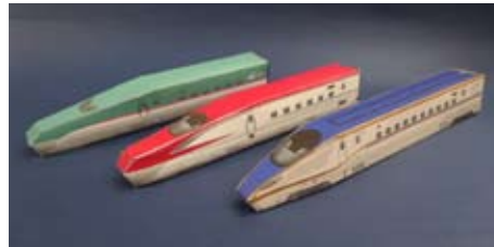
Image of completed paper-craft work

Various events that parents and children can enjoy together, such as a Paper-craft Class showing how to make a 3-D Shinkansen mock-up from special paper, take place in a variety of locations.