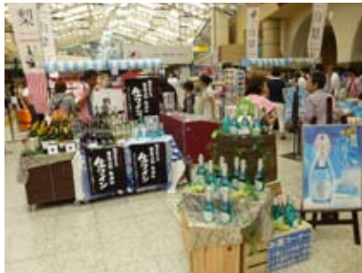
Rediscover Local Areas Project "Farm fresh market"

In regional areas, we opened A-FACTORY, a complex that consists of a craft center and market for processing Aomori-grown apples, in front of Aomori Station in the fiscal year ended March 2011. We are pursuing regional revitalization by deepening ties with the local people through various events and other means. In addition, in September 2013, we launched NOMONO 1-2-3, a manufacturing project for expansion of agriculture, forestry and fisheries to include food processing, logistics and marketing. Our pursuit of such expansion of industries to improve regional economies have included selling burgers made with Shinshu venison and opening a sweets shop specializing in Tokyo-grown ingredients in ecute Tokyo. We are working to revitalize the local food industry by holding farm fresh markets and through encouraging the expansion of agriculture, forestry and fisheries to include food processing, logistics and marketing.