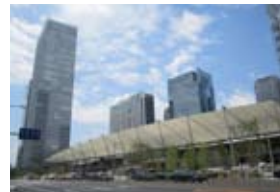
GranRoof and square in front of the Yaesu Exit