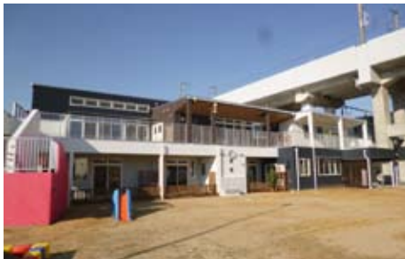
Nursery school near station along the Shinkansen line (Taishido Suisen Nursery School)

JR East has opened childcare support facilities such as “nursery schools near stations” located in easily accessible areas that are usually within a five-minute walk from the station, to support the combination of childcare and commuting to work. A total of 79 childcare support facilities were opened from 1996 through April 2014, and JR East is continuing to increase the number of these facilities. These nursery schools near stations have the advantage that parents can drop and pick up their children on the way to and from work. As evidenced by the scene that children come to the nursery with fathers, our childcare support encourages fathers’ participation in childcare as well.