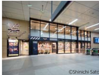
NOMONO, the local produce shop