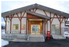
Fujisaki Station on the Gono Line