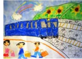
Fifth Children's Train Craftwork Exhibition