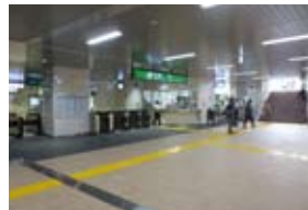
Free passage at Hakusan Station on the Echigo Line