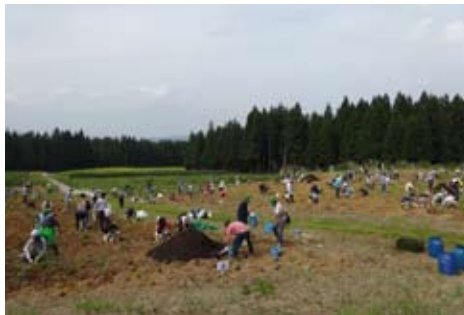
Shinanogawa River Hometown Forestation Program in September 2013

We undertook these programs with the cooperation of Fukushima Prefecture from 2004 to 2009 and with the cooperation of Niigata Prefecture and the towns of Tsunanmachi and Tokamachi in 2010. In addition, in other areas served by JR East, we are planting trees that are native to the areas and we shall continue to do the same in the future.