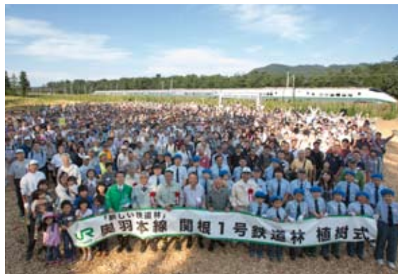
Ceremony for planting Sekine No.1 railway forest on the Ou Main Line (September 28, 2013)

Ceremonies for the planting of new railway trees were held in the Kakizaki No. 1 railway forest between Kakizaki and Yoneyama on the Shin-etsu Main Line on September 27, 2008, in the Oitama No. 2 forest on the Ou Main Line between Oitama and Takahata on July 26, 2009, in the Jinguji No. 2 railway forest on the Ou Main Line between Jinguji and Kariwano on May 22, 2010, and in the Okama No.1 railway forest on the Tazawako Line on September 29, 2012, and in the Sekine No. 1 railway forest on the Ou Main Line between Sekine and Yonezawa on September 28, 2013. With kind advice and guidance from ecologist and Professor Emeritus Akira Miyawaki of Yokohama National University, several varieties of native trees (potential natural vegetation, or PNV) were selected and planted. Many local residents and participants from organized tours took part in the ceremonies, and discovered how the trees they planted would grow to become useful as living railway disaster prevention facilities.