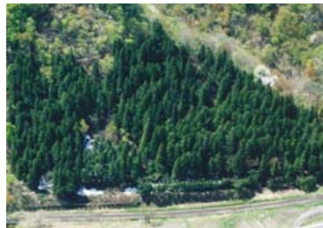
Tenoko No. 6 railway forest on the Yonesaka Line (forest to protect against snow slides)