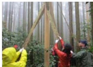
Thinning by debarking

In particular, during the fiscal year ended March 2013, LUMINE conducted outdoor activities designed to increase experience of environmental issues by reflecting employees’ desire to be actively involved in external activities through experience and visits. In order to raise employees’ environmental awareness, various programs were implemented jointly with other group companies, including the experiencing of the tree-thinning technique known as “thinning by debarking” and of beach-cleaning activities along the seashore of Tateyama, in Chiba Prefecture.