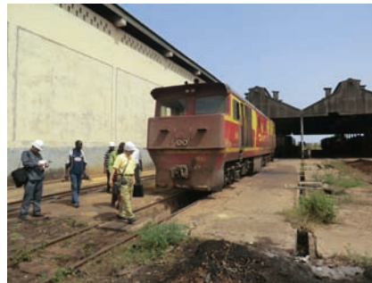
Railway in Ghana