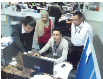
OJT in Cairo

Aiming for the nurturing of people who will be capable of increasing overseas development, JR East promotes the Global Human Resources Development Program—Ever Onward, which provides such options as overseas studies, overseas dispatch to public institutions and companies, and overseas railway consulting work on-the-job training (OJT). Overseas railway consulting work, OJT training, is a program conducted with the objective of developing human resources capable of serving as heart of the railway consulting business. In fiscal 2013, 22 people selected through open application were dispatched to Cairo (Egypt), Hanoi (Vietnam), and Ho Chi Minh City (Vietnam), and other trainees are actively working all around the world.