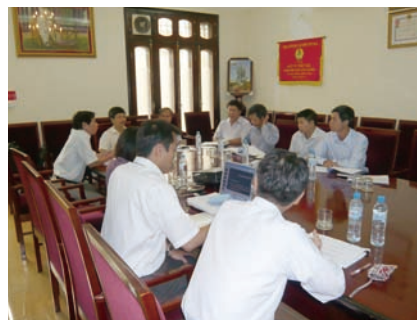
OJT in Hanoi