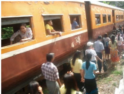
Railway in Myanmar

With the task of railway project information gathering, in addition to the previously established New York and Paris offices, in November 2012, we established Brussels, Belgium office, followed by a Singapore office in March 2013.