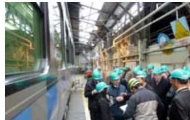
Inspection of the Koumi hybrid railcar (Koumi Line Operations Office)