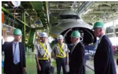
Inspection of Shinkansen railcar maintenance (Shinkansen General Rolling Stock Center)

JR East also receives inspection visits by overseas visitors involved in railway operations. During fiscal 2011, for example, we had 518 visitors from 48 countries. These visitors have included government officials from each country, people engaged in railway operation and researchers from universities and research institutes. These visits help to promote mutual understanding.