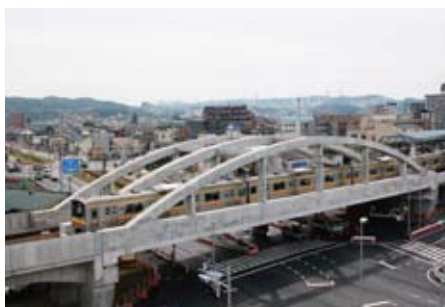
Railway overpass construction project in the areas around Inagi-Naganuma Station on the Nambu Line

With the combined objectives of reducing traffic congestion in the areas around Inagi-Naganuma Station on the Nambu Line and Niigata Station on the Shin-etsu Line, unifying towns, and eliminating congestion by reducing the number of level crossings, we are promoting railway overpass construction projects in cooperation with local governments.