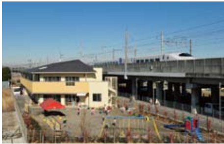
Shinkansen train and nursery school near station

JR East has opened childcare support facilities such as "nursery schools near stations" located mainly in the easily accessible area within some 5 minutes walk from station to support coexistence of work and the childcare. With the total of 59 childcare support facilities which have opened since 1996 (as of April 2012), JR East is striving to further increase the number of the facilities. These nursery schools near stations have such advantage that parents can drop and pick up their children on the way to and from work. As evidenced by the scene that children come to the nursery with fathers, our childcare support encourages fathers' participation in childcare as well.