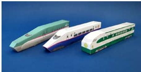
Image of completed paper-craft

Various events which parents and children can enjoy together, such as a Paper-craft Class showing how to make a 3-D Shinkansen mockup from special paper, take place in a variety of locations.