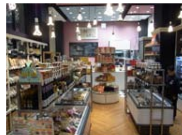
NOMONO, the local produce shop