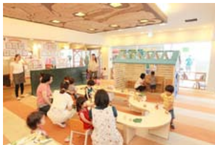
Nakama Room, play space inside Kizuna 937

The Parent-Child Community Café operated by JR East, is called "Kizuna 937 " and is located on the second floor of E'site Kagohara, in front of Kagohara Station on the Takasaki Line.