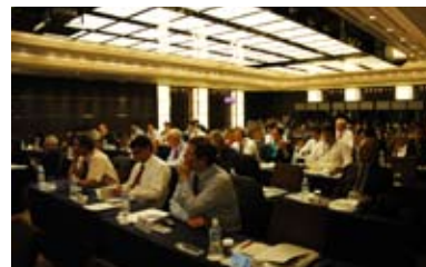
General Meeting of UITP Urban Rail Transport Committee (Tokyo, 2011)