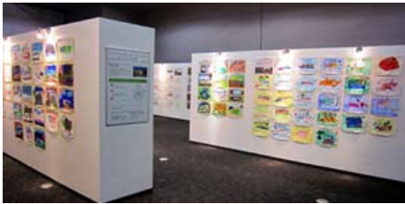
The Second Children's Train Craftwork Exhibition

With "trains" as its theme, original, creative and fantasy works created by children are enjoyed by many visitors. It also provides a space for displaying the activities of nursery schools and looking the development of children.