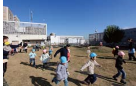
Children playing in station rooftop