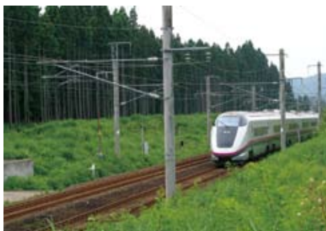
Jinguji No. 2 railway forest on the Ou Main Line (forest to protect against blizzards)

In 2008, after fundamentally reviewing the role of railway trees from the viewpoints both of disaster prevention and environmental preservation, we launched a new project to plant trees to replace those that will require replacement over the coming 20 years.