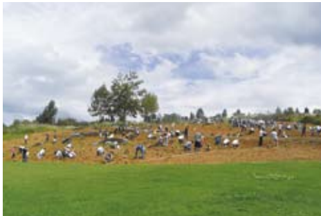
Shinanogawa River Hometown Forestation Program in September 2011

We undertook these programs with the cooperation of Fukushima Prefecture from 2004 to 2009 and with the cooperation of Niigata Prefecture and the town of Tsunanmachi in 2010. In addition, in other areas served by JR East, we are planting trees that are native to the areas and we shall continue to do the same in the future.