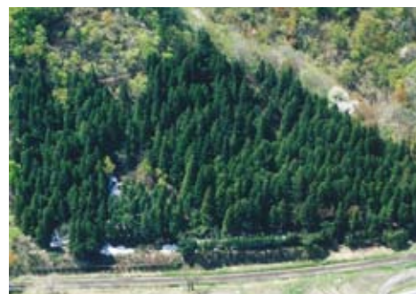
Tenoko No. 6 railway forest on the Yonesaka Line (forest to protect against snow slides)