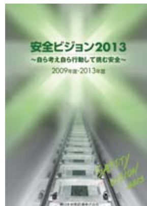
2013 Safety Vision Brochure

JR East will continue to remain steadfast in its efforts to achieve “ultimate safety levels” through the concerted efforts of all of its employees.