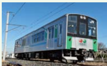
NE Train Smart Denchi-kun

In this system trains receive electric power from overhead lines in electrified sections and run while storing it in the storage batteries and in non-electrified sections, the trains run with power stored in the batteries. This system results in reduction of CO 2 as well as of noise compared with the conventional diesel cars. At present we are conducting running tests and rapid charging tests with a trial car, NE Train Smart Denchi-kun, in which this system is installed.