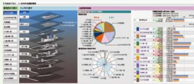
Energy flow visualization system at Tokyo Station

The conventional equipment system has been mostly focused on monitoring for the sake of security. By taking in information on energy conservation and making it visible, we are building a more efficient energy management system.