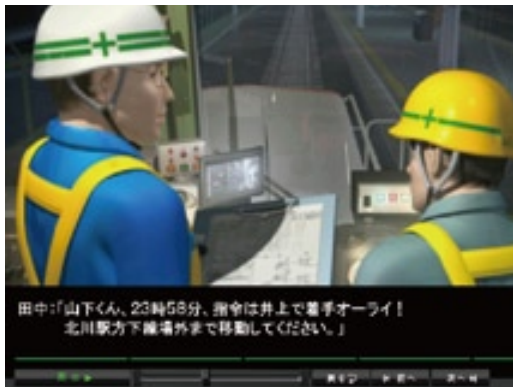
A scene from a case example

JR East has developed training tools for drivers and persons in charge of maintenance vehicles, and is utilizing the tools for training these people. Trainees can learn about frequently occurring human errors while conducting maintenance on trains through personal computers. The objective of the training is to assist trainees in learning the necessary skills for the prevention of human error. The tools encourage “thinking and speaking by themselves” trainee initiative and promote active learning through encouraging trainees to discover new things through mutual learning with other trainees and shared experience. By doing so, the tools aim for the training contents to be rooted and prevent operational accidents with maintenance vehicles.