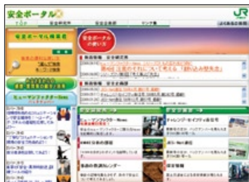
Safety web portal site

To allow our employees to deepen their understanding of the human factors involved in accidents and share information and know-how on human error prevention, JR East developed and runs a web portal site on safety, which employees have had access to since April 2007. On this site, useful safety information is regularly provided and available to our employees. The information is stored on the site in a database so that employees can search for necessary information whenever needed. Major content areas of the site include: human factor news, the 4M4E analysis room, a calendar of past accidents with lessons to be learned, and the Challenge Safety blue signal.