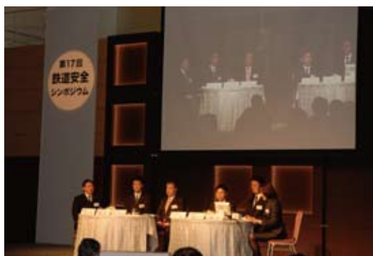
The 17th Railway Safety Symposium

Since 1990, we have held the Railway Safety Symposium for the purpose of improving each employee's awareness of safety. In the fiscal year ended March 2009, JR East held its 17th symposium, "Safety relies on our front-line employees: at the launch of 2013 Safety Vision."