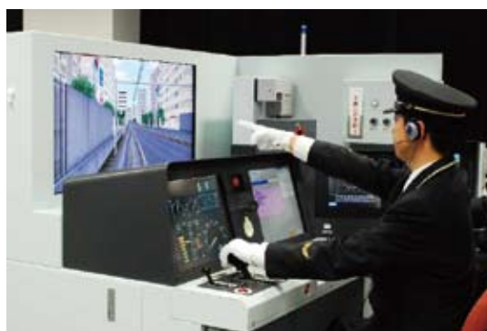
Driver cab simulator

To improve the skills of train crews, accident prevention simulator training is conducted regularly in the General Training Centers in each of our branches. At the JR East General Education Center in Shirakawa City, Fukushima Prefecture, we train both drivers and conductors, and provide human resource development in the form of knowledge and technical proficiency. The Accident History Exhibition Hall was established in the Center to emphasize the importance of learning from past accidents.