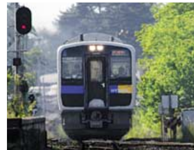
The world's first diesel hybrid railcar operating on the Koumi Line