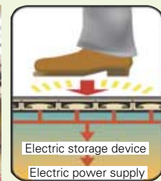
Mechanism of the power-generating floor