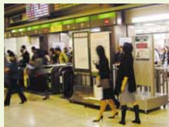
Demonstration experiment at Tokyo Station

We are working on research and development of a "power-generating floor" which generates electricity from the vibration caused by people walking on it. Pressure of footsteps on the floor is transformed into electricity by piezoelectric elements under the floor. From October to December 2006 the power-generating floor was installed on the passageway at the Tokyo Station Marunouchi North Exit ticket gate, as a demonstration experiment. The output is small and it is still in the development phase; we are working on this development as one of our new challenges.