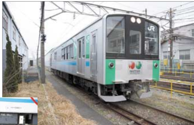
Test runs of the world's first fuel-cell hybrid railcar started

There are still many challenges to overcome with fuel cell technology, and it will take some more time before its commercially viable application, but we are committed to the development of this technology with an eye on the future.