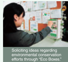
Soliciting ideas regarding environmental conservation efforts through "Eco Boxes."

We have carried out a wide range of initiatives aimed at reducing our impact on the environment. With the recognition that in order to further strengthen our commitment to environmental conservation, we must improve each of our approximately 60,000 employees' awareness of the environment, and remain committed to environmental conservation, we have looked for ways to accomplish this. As one step in this process, in February 2005 seven organizations of the JR Hachioji Branch Office launched JR East Eco Activities on a trial basis.