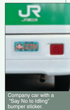
Company car with a "Say No to Idling" bumper sticker.