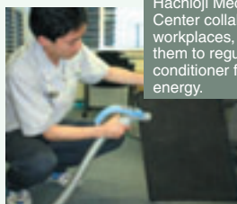
Hachioji Mechanical Technology Center collaborates with other workplaces, in order to encourage them to regularly clean their air conditioner filters to help conserve energy.

Of course we have had activities to raise environmental awareness, such as environmental education, but the JR East Eco Activities feature a Plan-Do-Check-Action (PDCA) cycle carried out at the workplace level, where we set action targets, take necessary measures, review them each year, and further vitalize our activities. The goal of the JR East Eco Activities is to incorporate our concept of environmental conservation into our work and working environments in concrete ways. Each workplace determines what activities to do through brainstorming sessions among all employees under the initiative of its eco leader.