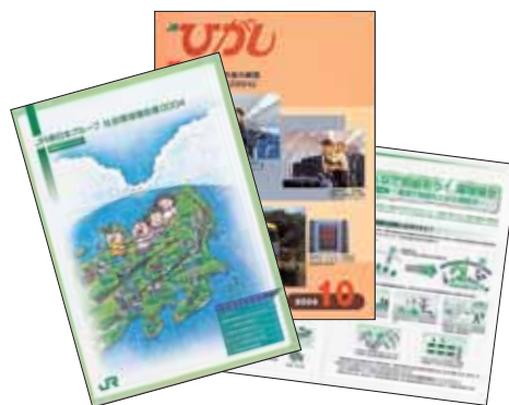
Summary version of JR East Group Sustainability Report is given to all the employees. In-house magazine "JR Higashi" also carries environmental information.

In fiscal 2004, we also launched a new training program for personnel responsible for environmental matters at all Group companies. In addition, we distributed a summary version of the JR East Group Sustainability Report to all employees.