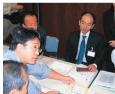
Held in collaboration with the Japan Environmental Education Forum, the "Environmental Management Strategy Game" served as training for environmental managers in the JR East Group.

This team found a way to save 583 tons of water per year. Conventionally, water was left running in the railcar-washing hose to prevent it from freezing but this team used compressed air to completely remove water from the hose, thereby reducing water consumption.