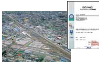
A maintenance facility for railcars in the Nagano area, the Nagano General Rolling Stock Center acquired ISO14001 certification in fiscal 2004.

JR East has continued with its efforts to acquire ISO14001 certification, an international standard for environmental management systems, particularly for locations with relatively high environmental impacts. Several sites acquired the certification since the Niitsu Rolling Stock Manufacturing Factory was the first to do so in fiscal 1998, with the most recent being the Nagano General Rolling Stock Center in fiscal 2004.