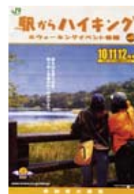
The "Hiking from Stations Program" is comprised of an event course available only by advance reservation and a recommended course that requires no reservation.