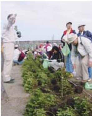
A total of 29,000 people had participated in Railway Lines Forestation Programs by FY2003.

Since 1992, employees from all branches have been volunteering to plant trees with the help of local residents. As of FY 2003, a total of about 29,000 people have participated and 230,000 trees have been planted. In 2002, tie-ups with local governmental bodies began; in 2003, for example, the Yokohama Branch held a "Sagami Line hiking" event in cooperation with local governments along the railway line, during which 650 participants planted 1,000 trees.