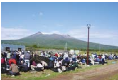
During the Onuma Hometown Forestation Program , a forestation event in Hokkaido, participants planted 25,000 seedlings in pots and planted 2,400 Japanese oak trees.