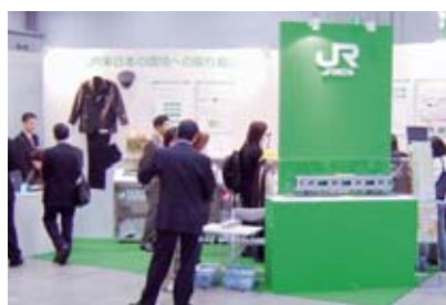
About 1,500 persons took part in an environmental quiz held at the JR East booth.

In December 2003, we exhibited at the “JR East Environmental Actions” booth at the “Eco-Products Exposition 2003.” We introduced our activities to the 114,060 visitors to the exposition by displaying information about our recycling activities and initiatives for intermodal transport as well as by presenting a model of the energy-efficient 209 series railcar and the mechanisms of the NE train.