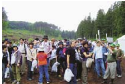
600 volunteers including company employees and members of the public participated in the Native Forest Regeneration Project in Fukushima to plant trees.

Based on a sense of gratitude toward the natural environment and a desire to contribute to the future of the planet, JR East plants trees indigenous to each region and promotes reforestation. As one aspect of these activities, the JR East Group employees and members of the public planted 45,000 trees of 22 different species in May 2004, as the first step of the 3-year Native Forest Regeneration Project in Fukushima. Participants planted trees and went on nature walks that allowed them to experience the natural environment and observe the diverse ecological systems that trees support.