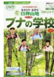
A pamphlet from the "Beech School" tour; a guided tour that allows participants to experience the wonders of nature

JR East offers a variety of eco-tours designed to allow people to experience the wonders of nature. In May 2003, the "First Shirakami Mountains Beech School, Tokyo Branch" was held, which introduced participants to the wonders of the Shirakami Mountains, the first place in Japan to be designated as an UNESCO World Heritage site. In addition, as in FY 2002 the "Shirakami Mountains Beech School" tour was held, with 150 people participating. The "Hiking from Stations" program, in which visitors take nature walks from stations, was continued. In FY 2003, total of 200,000 people have attended to 350 the event courses, which requires reservations in advance.