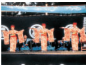
"Ayako Mai" held in Kashiwazaki City, Niigata Prefecture, FY 2002

Since FY 1993, the Foundation has been supporting and promoting the revival of traditional regional culture throughout eastern Japan. In FY 2002 we subsidized 12 projects at a total cost of 56.05 million yen.