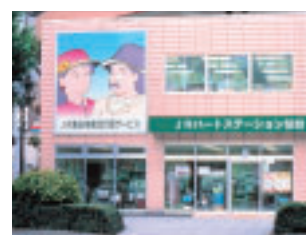
JR East Tohoku Nursing Care Service Center Home for the Elderly

Meanwhile, Nippon Restaurant Enterprise Co., Ltd. is preparing to open a home for the elderly in Ota-ku, Tokyo in 2004.