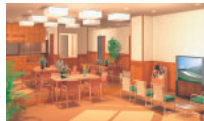
NRE Omori Yayoi Heights (tentative name) Home for the Elderly scheduled to open in 2004