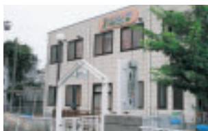
Reliability and safety are JR East's top priorities at J Kids/Planet JR Tsurumi Nursery School (Yokohama)

Being able to drop off and pick up children at the station shortens parents' commutes. We see more fathers dropping off their kids. In fact, data shows nearly 90% of users head to work directly after dropping their children at daycare. The centers also make it easier for parents to shop in