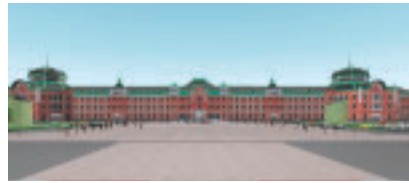
Example of Meiji/Taisho era architecture (Restored Marunouchi Stationhouse image)

In May 2003, the classic red brick Marunouchi Stationhouse located at Tokyo Station was designated an important national cultural asset. This stationhouse opened in 1914, but the third floor was destroyed by fire in 1945 during the war. We are now conducting research and planning to restore the interior and exterior of the third floor to its original state.