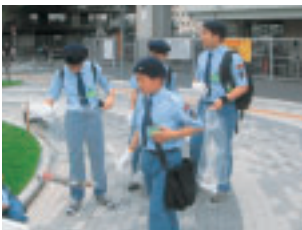
JR East conducts Children's Railway Association activities

The Children's Railway Association was established in 1960 and is active throughout Japan. The association sponsors various activities for children designed to teach proper railway etiquette, including station beautification projects and field trips to railroad facilities. The Traffic Manners Association manages the Children's Railway Association; JR East provides support services including personnel at branch offices, space to hold activities, and railroad engineer simulators.