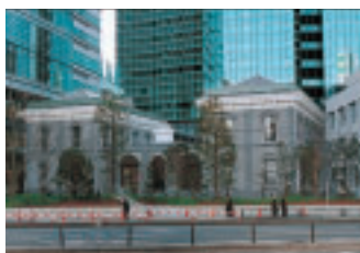
Visitors can see the old station's original foundation stones. Parts of the platform and tracks have also been restored.

In April 2003, on the site of the Old Shimbashi Station, we opened a building that recreates the old station's 1872 exterior. We restored, as accurately as possible based on archival records, the external appearance of the station in its original location. The building also now houses a Railway History Display Room and "the Grand Café Shimbashi Mikuni" restaurant.