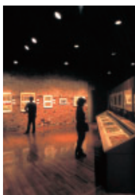
Tokyo Station Gallery displays a range of genres