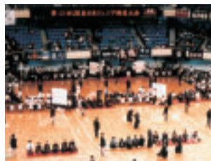
JR East Junior Kendo Tournament provides friendly competition with other fencers

The August 2003 JR East Junior Kendo (Japanese fencing) Tournament was the 14th such competition sponsored by JR East. Open to young people living in areas served by JR East lines, the tournament gives competitors the opportunity to test their skills against others. In addition, we also sponsor ski tournaments at Gala Yuzawa ski resort, a soccer league for Kanto-area universities, and other sporting groups and events.