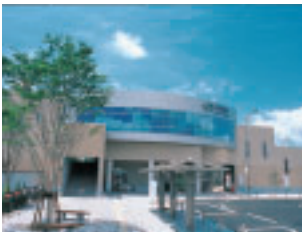
Sagae Station (Aterazawa Line) features a Community Center

For JR East, a local station is more than a point of departure and return; it is a cultural gathering place where all segments of society come together for information. We play a significant role in revitalizing local communities. To this end we establish joint facilities such as community centers and libraries adjacent to station buildings and work with local governments to develop plans for the surrounding areas when refurbishing stations.