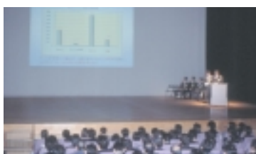
Presentation of small group activities

JR East endeavors to support and popularize small group activities and activities suggested by employees that lead to the revitalization of the workplace, ability development, and work improvement. In fiscal 2001, about 6,400 circles and about 33,900 employees participated in such activities. These autonomous activities and positive activities suggested by employees inject vitality into JR East's corporate culture.