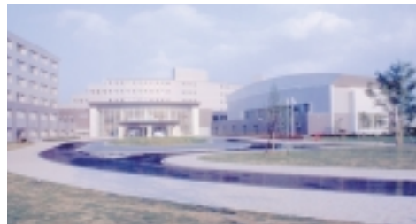
JR East General Education Center

JR East has introduced various training courses at the group’s facilities. These venues include the JR East General Education Center, each branch office’s training facilities, general training centers, and business training centers. We conduct safety and accident prevention training that is the base of rail operations, as well as training to enhance the standard of services and management.