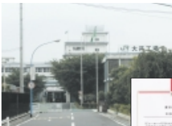
JR East Oi Workshop

In March 2002, JR's Oi Workshop obtained a "first" for any railway company, OHSAS 18001 Certification,* which means the company has met internationally recognized standards for its occupational health and safety management system. We aim to enhance health and safety standards even further by continuously improving this system.