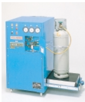
CFC recovery system

For the air-conditioning systems of our railcars, some diesel cars and passenger cars are equipped with specific CFC (R12)-based or alternative CFCs (R22, R134a and R407C) substitute-based air-conditioning systems. In the latest model of the E231 series, CFC R407C, which has no harmful effect on the ozone layer, is used. We endeavor to prevent these gases from leaking and periodically check for gas leakage. We recover CFCs during car scrapping in accordance with the Fluorocarbons Recovery and Destruction Law and process the discarded cars in the appropriate manner. At the end of 2001, 2 tons of specific CFCs and 96 tons of alternative CFCs were used.