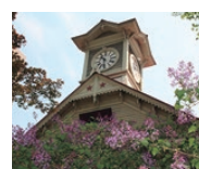
Sapporo Clock Tower (Sapporo, Hokkaido)