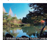
Kenrokuen Garden (Kanazawa, Ishikawa Prefecture)