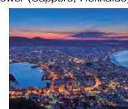
Night View (Hakodate, Hokkaido)