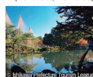
Kenrokuen Garden (Kanazawa, Ishikawa Prefecture)