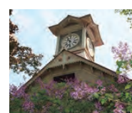
Sapporo Clock Tower (Sapporo, Hokkaido)