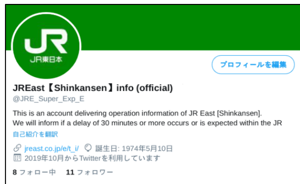
Screen image of Shinkansen