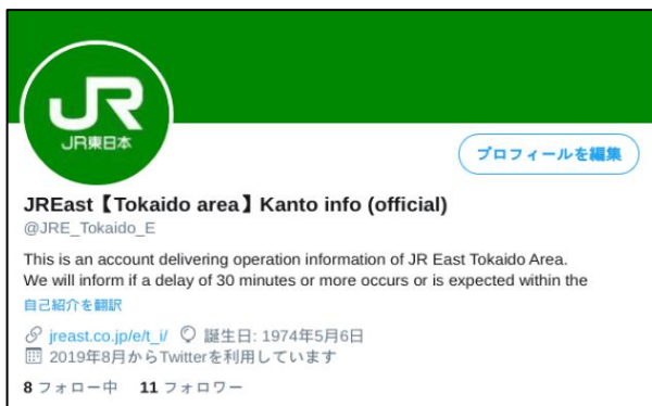
Screen image of Tokaido area

If a delay of more than 30 minutes occurs or is expected in the JR East area between 4 o'clock and 2 o'clock on the next day, we will inform the train operation status. In the case of normal train operation, the operation status will be distributed every day at 7am and 5pm. In addition, we will inform BRT service information only when the operation will be suspended for a long time.