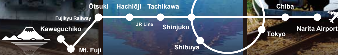
* Map is abbreviated * Stations from Ōtsuki to Kawaguchiko are on the Fujikyu Railway