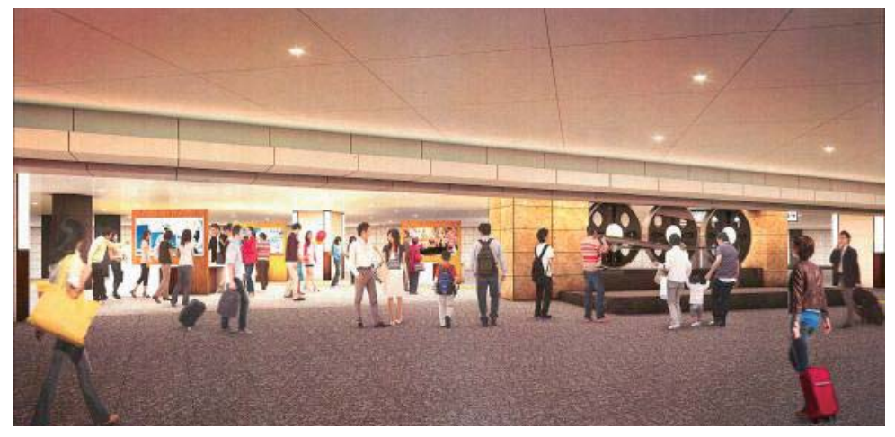
* This image may differ from the actual refurbishment.

[Image of the driving wheel monument moved in front of the Marunouchi Underground South Entrance Waiting Space (provisional name)]