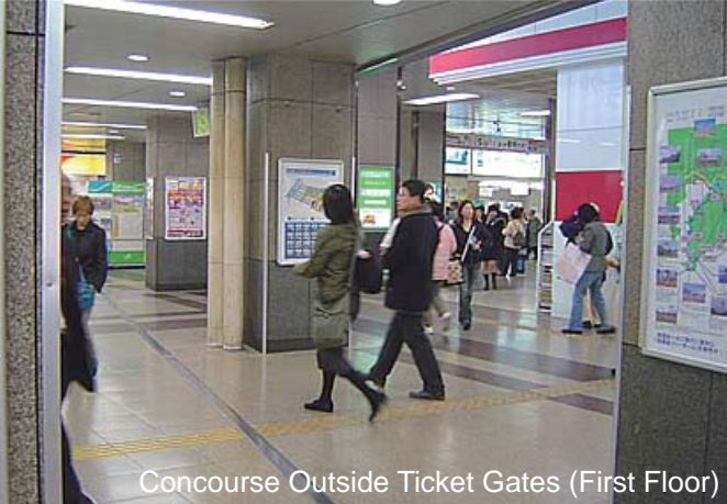
Concourse Outside Ticket Gates (First Floor)

Existing The ceiling under the elevated deck is low and there are too many columns