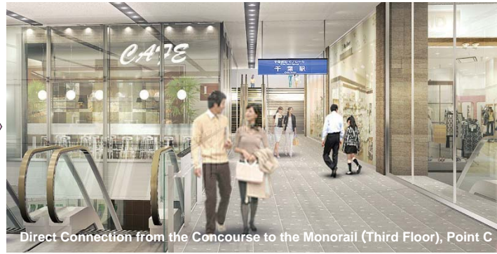
Direct Connection from the Concourse to the Monorail (Third Floor), Point C

Planned Direct Connection to the Monorail from the Third Floor