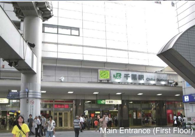
Main Entrance (First Floor)