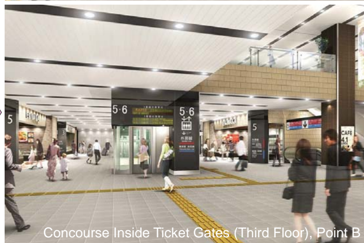
Concourse Inside Ticket Gates (Third Floor), Point B