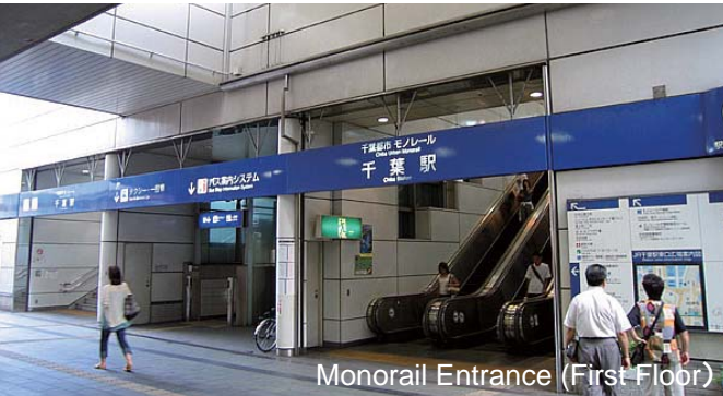
Monorail Entrance (First Floor)

Existing Access from the First Floor to the Monorail Station on the Third Floor