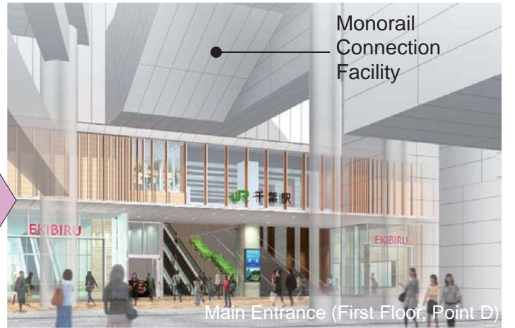
Main Entrance (First Floor, Point D)