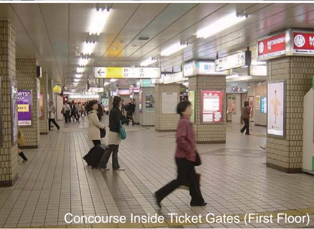
Concourse Inside Ticket Gates (First Floor)