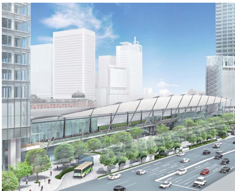
Overall View of the Station Plaza

Bus Departure Area: 13 Places / Taxi Boarding Area: 4 Places / Taxi Pool: 50 Vehicles