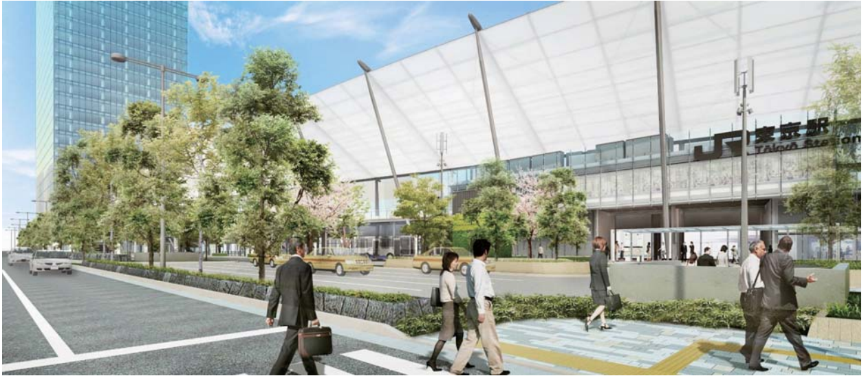
View from Sotobori-dori Avenue

Note) The perspective view is an artist's impression of the current plan, which may change in the future.