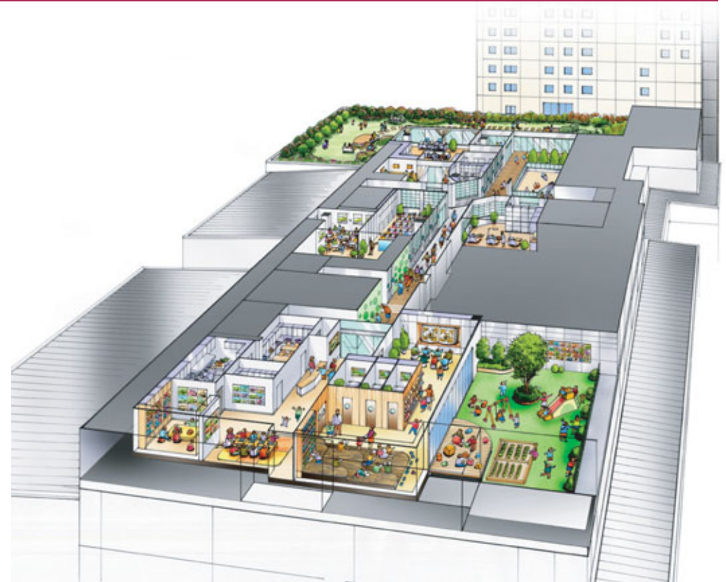
① The top floor has a day-care facility and a clinic located in an expansive garden area.

② The Tamahiyo brand, which has strong recognition among young mothers, is used through a tie-up with Benesse Corporation. The aim was to provide enhanced satisfaction and to create a buzz.