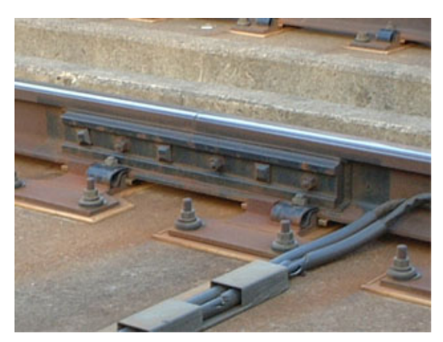
Current configuration of installed insulated joints