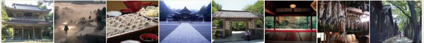
Myōkō and Jōetsu Area/Rinsenji Yuzawa and Uonuma Area/Tanada Nagaoka and Kashiwazaki Area/Hegi soba Yahiko and Sanjo Area/Yahiko-jinja Shrine Sado Area/Sado Goldmine Niigata and Aga Area/Northern Culture Museum Murakami and Shibata Area/Murakami Sahn Dishes Shōnai Area/Sankyo Warehouse

*For more information about the gifts described above and tickets for the Sado Kisen Ferry, please visit the following website: http://www.jreast.co.jp/e/niigata/ *The gift campaign will finish at each location once all gifts have been given out.