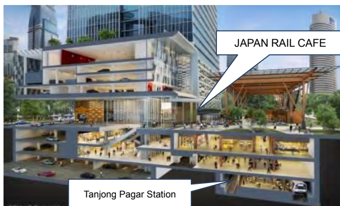
Access to JAPAN RAIL CAFE