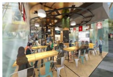
In-store event image

Seasonal cuisine and drink, as well as sundries and foods, that give a sense of Japan will be sold.