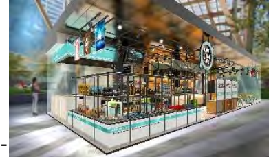
Outside appearance of store