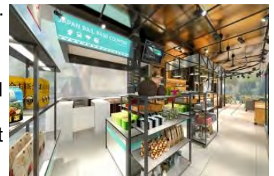
Travel service counter