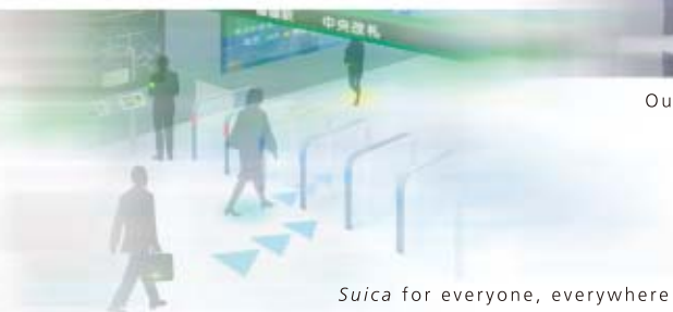
Suica for everyone, everywhere