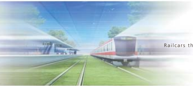
Railcars that run on fuel cells are in operation