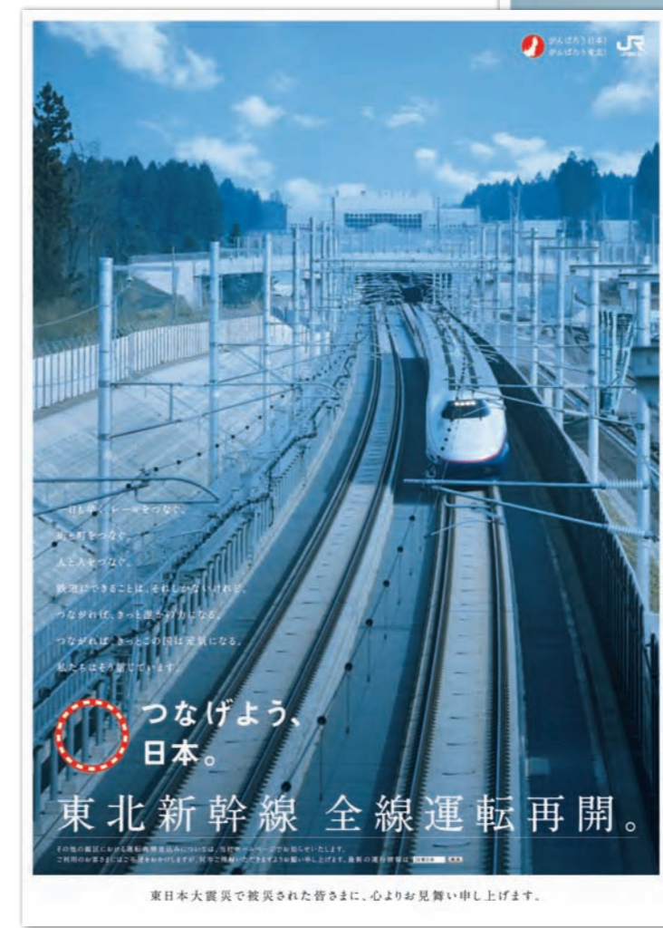
A poster released when the operation of Tohoku Shinkansen resumed. Show JR East’s message: We will support reconstruction of Tohoku regions by connecting areas with our trains.