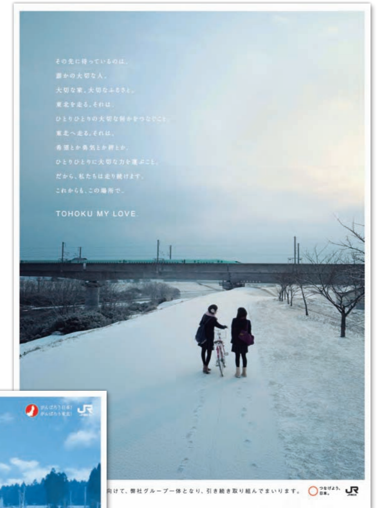
A poster “TOHOKU MY LOVE”, released around the first anniversary of the Great East Japan Earthquake. Show JR East’s message: We will consider the future of communities together with local communities and take action accordingly.