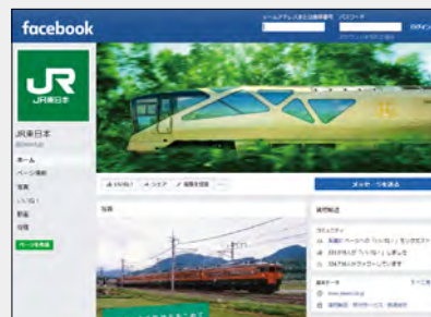
JR East's Official Facebook Page