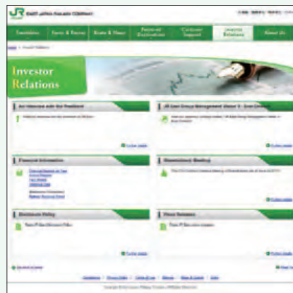
Investor Relations http://www.jreast.co.jp/e/investor/index.html