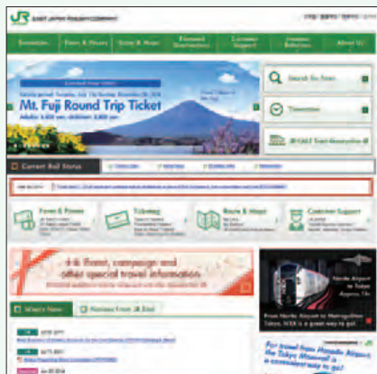
Home Page http://www.jreast.co.jp/e/index.html

JR East's website offers a variety of information including investor relations (IR) information, company data, and an overview of the Company's businesses. The website can be viewed in Japanese, English, Chinese and Korean. The Annual Report and various other reports can also be downloaded from the website. The website also contains a wealth of tourism information about Japan and related information.