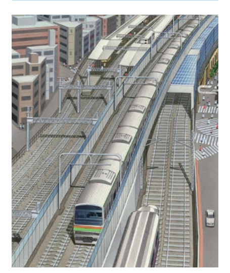
Concept illustration of Tohoku Through Line

Currently at Shinagawa Station, Tokaido Line trains arriving from the direction of Tokyo Station cannot return toward Tokyo Station. Therefore, JR East is developing facilities at Shinagawa Station that will allow the return of trains from the Utsunomiya, Takasaki, and Joban lines—which will reach Shinagawa Station with the opening of the Tohoku Through Line.