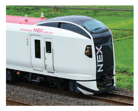
E233 series railcar (right) New-type E259 Narita Express railcar (far right)