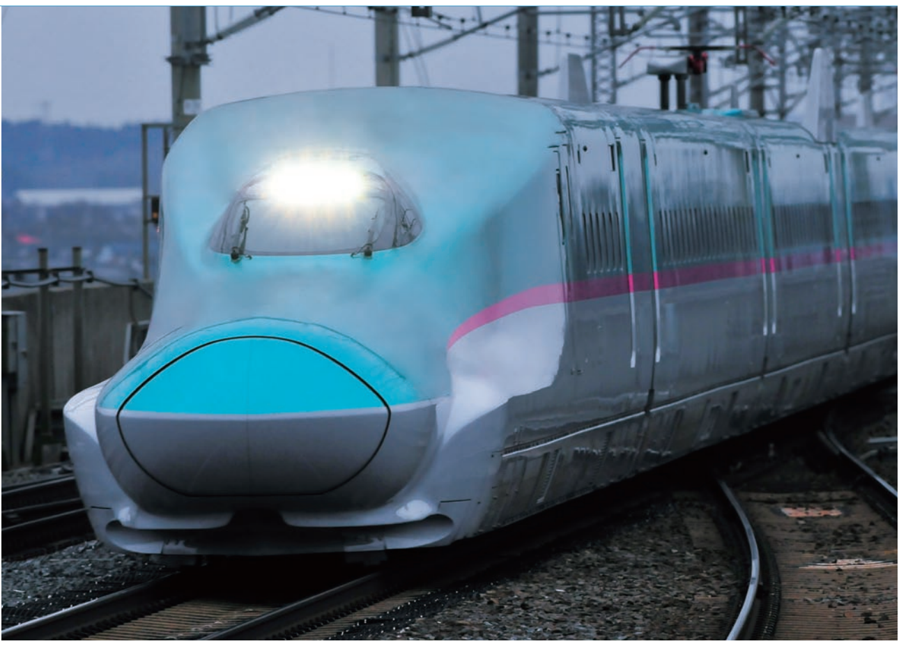
Prototype for E5 series