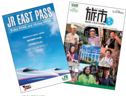
JR EAST PASS Tabi-Ichi pamphlet (right)

In addition, given the planned expansion of international flight services to Haneda Airport (Tokyo International Airport) at the end of October 2010, JR East will work with Group companies Tokyo Monorail Co., Ltd., and JR EAST VIEW Travel Service Co., Ltd., to examine further upgrading of related services.