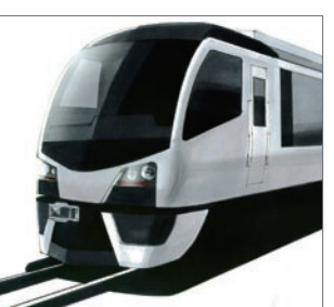
kiha E120 series railcar