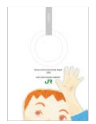
Social and Environmental Report The full Social and Environmental Report is available for download at http://www.jreast.co.jp/eco/ english/index.html

JR East continues to promote the construction of comfortable railways that can easily be used by not only physically disabled people, but also passengers that are not accustomed to using railways, in line with the trends of an aging society and international society at large. Specific enhancements include the installation of elevators, escalators and information signs, and the provision of multi-purpose toilets. In addition, JR East's AC Train , a next-generation commuter train system, has specially designed entry and exit steps to facilitate wheelchair accessibility.