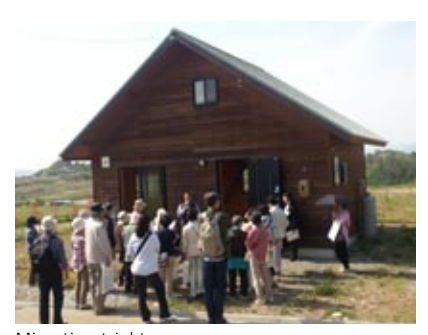
Migration trial tour

People moving to regional cities or making short stays there sometimes need support, especially in the aspect of mobility. We offer support using Group resources, such as long-term car rental discount plans for members of the Otona no Kyujitsu Club.