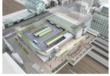
Upgrading of Transfer Node in Shinjuku

Large numbers of people pass through stations where different transport services meet. To reduce urban area congestion and to make travel more convenient, we have been increasing the number of through services and improving our connections with other means of transport, in cooperation with national and local governments. We are also improving transfer nodes to other transport, such as to bus terminals and taxi loading areas. One example is constructing a bus terminal above the railway tracks at Shinjuku Station, in collaboration with the Ministry of Land, Infrastructure, Transport and Tourism, which contributes to the convenience of the entire multi-mode transportation system.