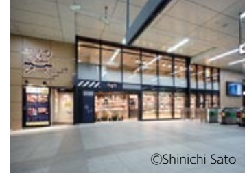
NOMONO, the local produce shop