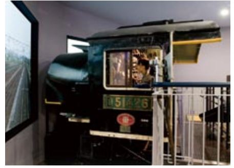
The Railway Museum